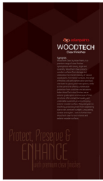
WOODTECH CLEAR FOLDER