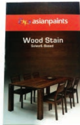
AP WOOD STAINS FOR INTERIOR SHADE CARD