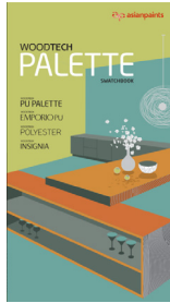
WOODTECH PU PALETTE SHADE CARD