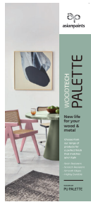
PU PALETTE SHADE CARD