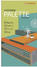
WOODTECH PU PALETTE SHADE CARD