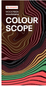
WOODTECH WOOD STAIN SHADE CARD