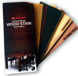
WOODTECH WOODSTAIN FOR INTERIOR FANDECK