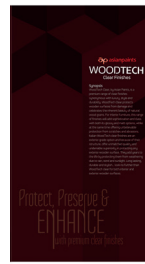
WOODTECH CLEAR FOLDER