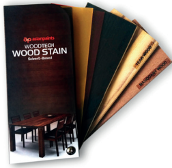
WOODTECH WOODSTAIN FOR INTERIOR FANDECK