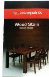
AP WOOD STAINS FOR INTERIOR SHADE CARD