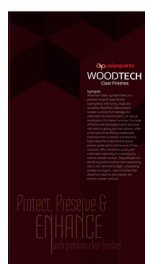
WOODTECH CLEAR FOLDER