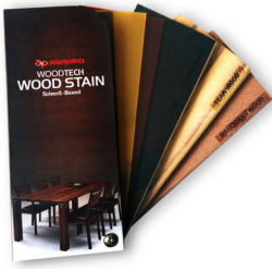
WOODTECH WOODSTAIN FOR INTERIOR FANDECK