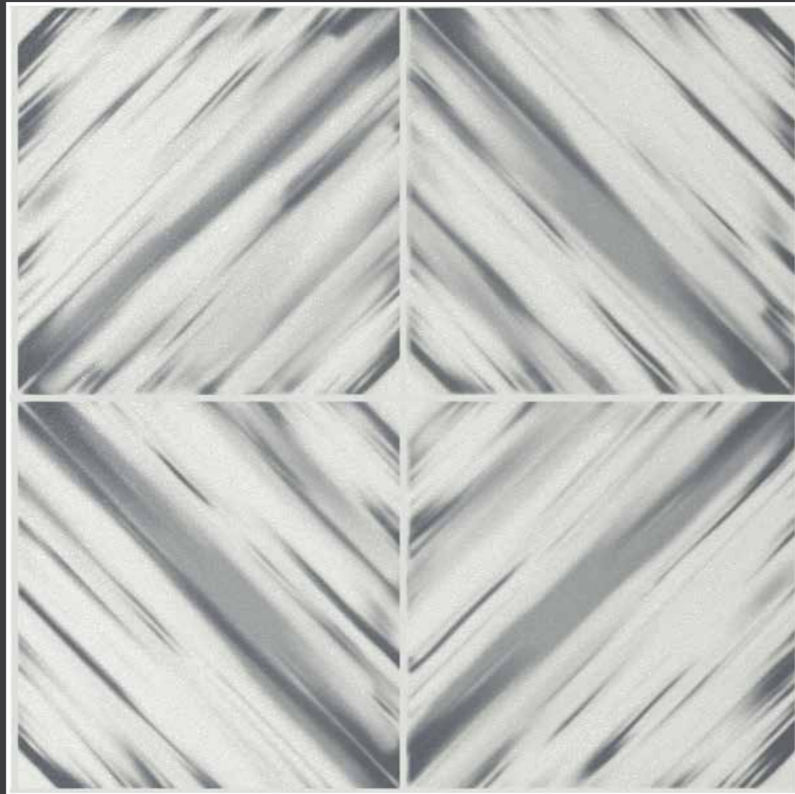
BASE COAT - BLUE HARMONY (7252) | TOP COAT - PENCIL SKETCH N (K296)