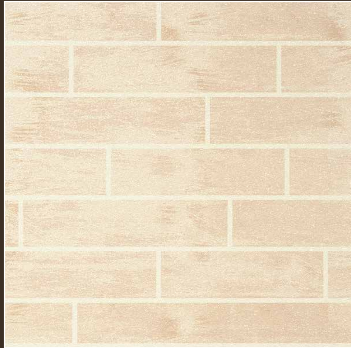
BASE COAT - SAND BED (7980) | TOP COAT - SPICE (0477)