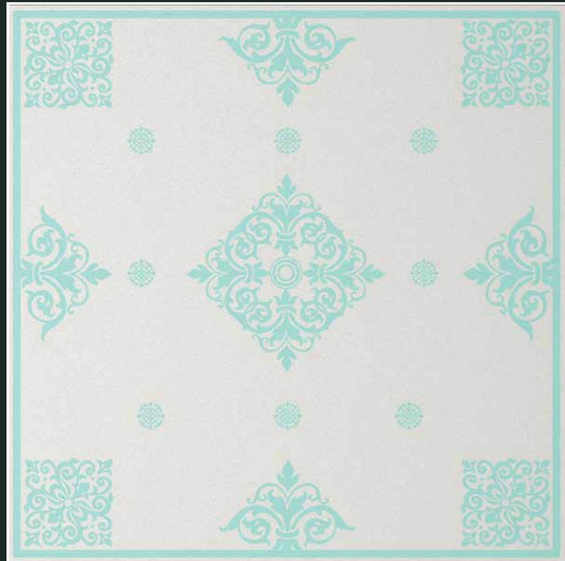
BASE COAT - LAP OF HIMALAYA (L186) | TOP COAT - MARINE GREEN (7514)