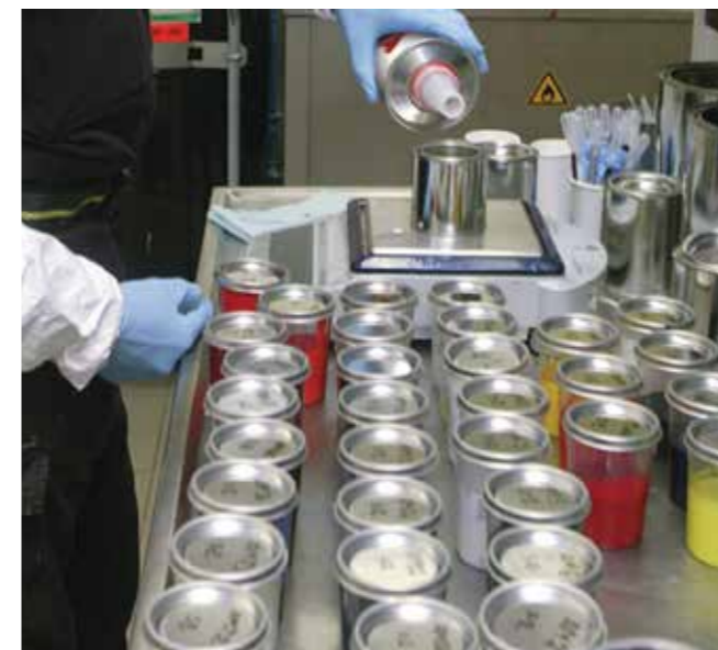
Extensive tests have proven Starclass Spectra Basecoat quality and economy in use.

Productivity & quality can be maintained in virtually any climate because Starclass Spectra basecoat can be used in a wide range of ambient temperature and humidity levels. It outperforms other mid-range brands in quality, in application time and in product consumption.