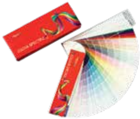
COLOUR SPECTRA FAN DECK